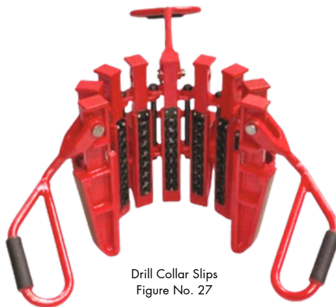
Drill Collar Slips Figure No. 27