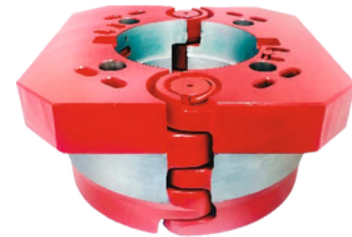
Master Bushing for Oilwell RT Model: SDTIMB 3750-SQ Figure No. 2