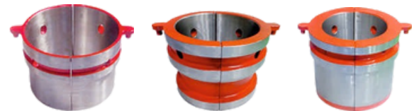
Insert Bowl No. 1 Insert Bowl No. 2 Insert Bowl No. 3 (Suitable for above all three models of Master Bushing) Figure No. 3