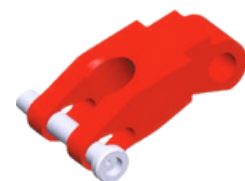
Pneumatic Backsaver Adapter Figure No. 32